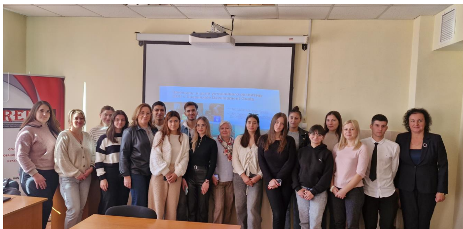
Students of the Faculty of Economics (Comrat State University), specializing in Tourism, Hospitality and Leisure