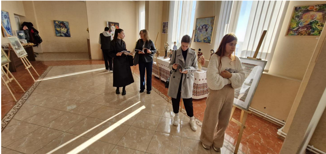
In the Arts Gallery Hall of the ATU Gagauzia, Comrat University' students got acquainted with the creative works of Gagauz authors, which were used in the creation of Gagauzia's tourism brand, contributing to the promotion of the region's diverse cultural tourism resources and the branding of the autonomy.